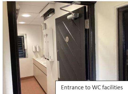
Entrance to WC facilities