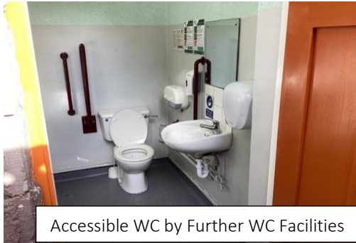
Accessible WC by Further WC Facilities