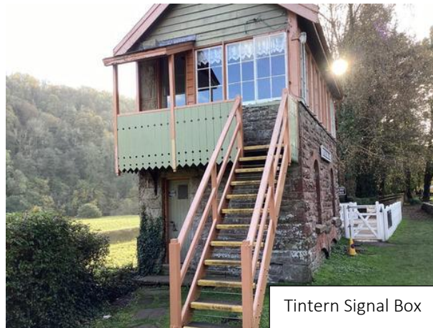
Tintern Signal Box