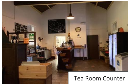
Tea Room Counter