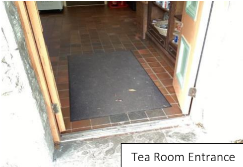
Tea Room Entrance