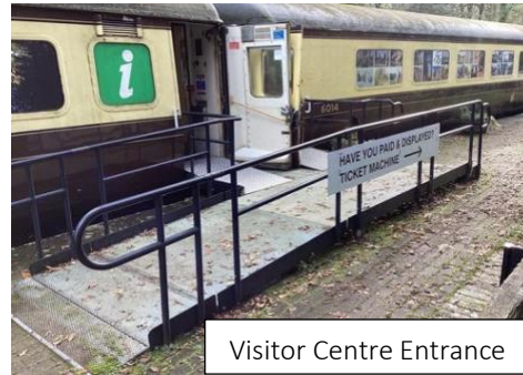
Visitor Centre Entrance