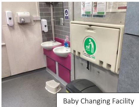
Baby Changing Facility