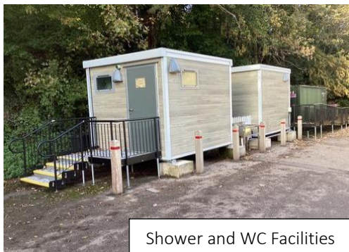
Shower and WC Facilities