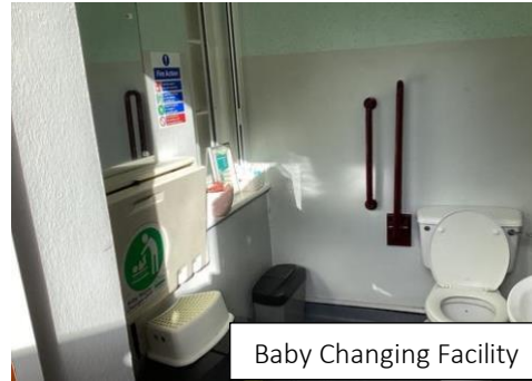
Baby Changing Facility